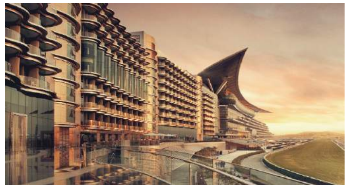
The Meydan Hotel with views of the racecourse