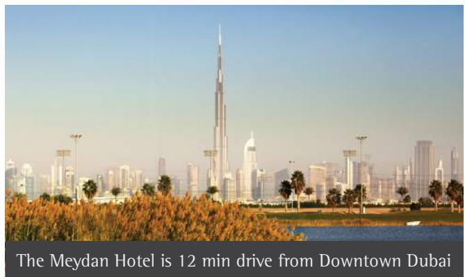
The Meydan Hotel is 12 min drive from Downtown Dubai