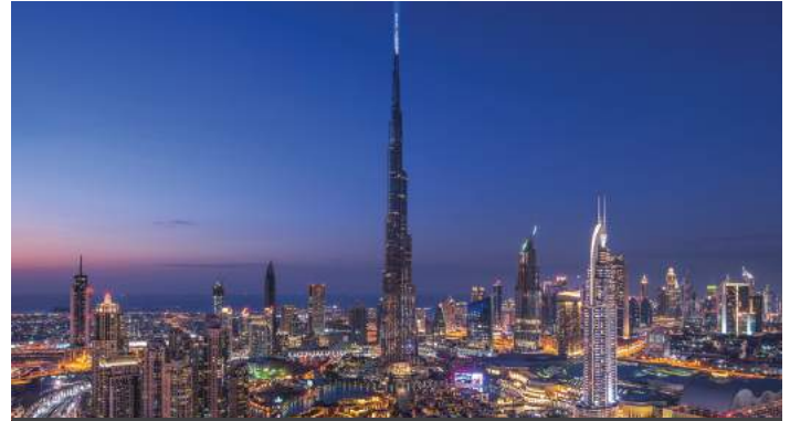
The fascinating city of Dubai with Burj Khalifa

Overlooking Burj Khalifa and the Dubai skyline, the Amphitheatre is ideal venue for spectacular events, concerts and lavish dinners in the open air. Apron Views, features a super-sized outdoor screen on the Racecourse, this trackside location is ideal for large functions such as festivals, brand showcases and car launches.