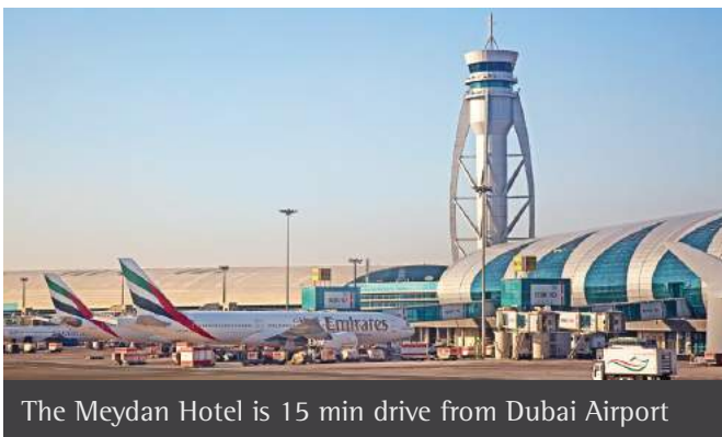
The Meydan Hotel is 15 min drive from Dubai Airport

90 min Abu Dhabi International Airport (AUH)