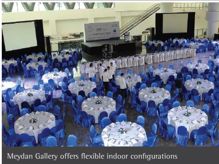
Meydan Gallery offers flexible indoor configurations