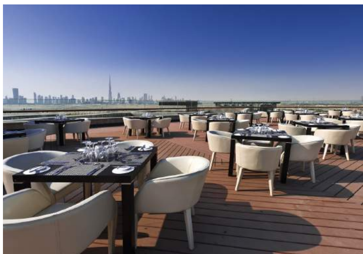
The Sky Bubble Terrace offers 360 views of Dubai