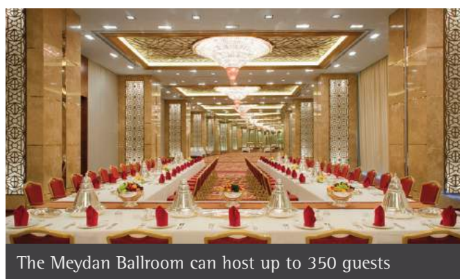
The Meydan Ballroom can host up to 350 guests

Please note that the below capacities are calculated without stage/screen and projector