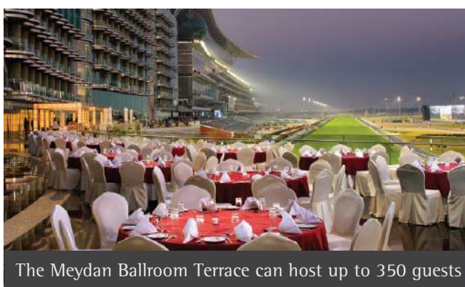
The Meydan Ballroom Terrace can host up to 350 guests