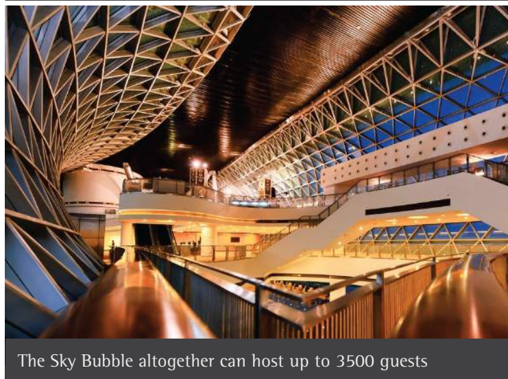
The Sky Bubble altogether can host up to 3500 guests