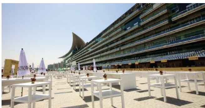
The Apron Views can host up to 15000 guests