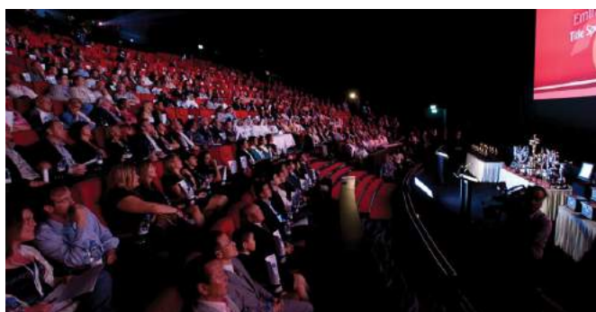
The Meydan Theatre can host up to 560 guests