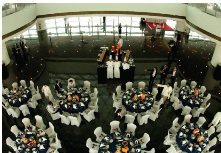
The Sky Bubble Level 7 can host up to 750 guests