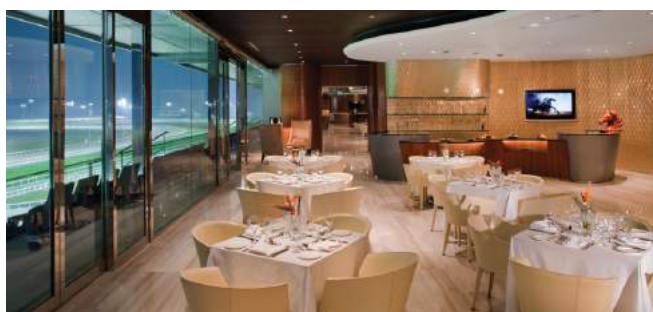
72 Exclusive Hospitality Suites