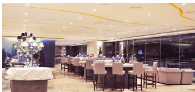
Social Function at the Grandstand