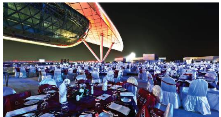
Iconic venues for any types of events

Al Meydan Road, Nad Al Sheba P.O. Box 9305 Dubai, United Arab Emirates