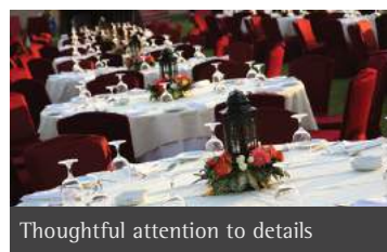
Thoughtful attention to details