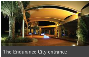
The Endurance City entrance