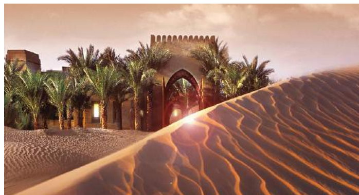
Bab Al Shams means “gateway to the sun”

Each journey to Bab Al Shams Desert Resort & Spa is an experience on its own. The resort is a 45-minute drive from Dubai International Airport and 95 km from Abu Dhabi International