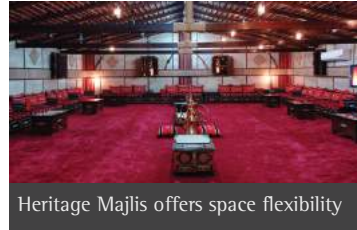
Heritage Majlis offers space flexibility