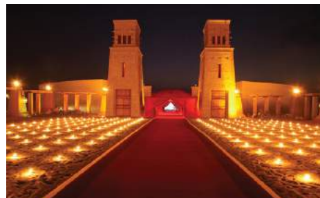
The Events Arena is the first outdoor desert arena in Dubai