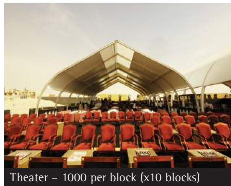
Theater – 1000 per block (x10 blocks)