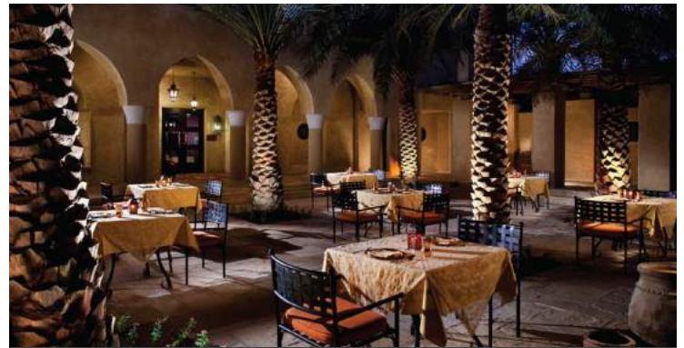
Masala can host up to 230 guests