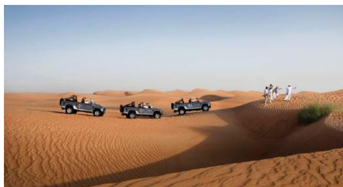
The awe-inspiring Dubai desert landscape

The Bab Al Shams Events Arena offers an unrivalled venue for vast concerts or gala dinners suitable for up to 6,000 people seated or 55,000 people standing. Sophisticated stage configuration mean the purpose-built space sets the Events Arena apart from anywhere else in the region.