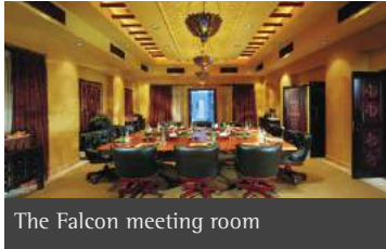
The Falcon meeting room