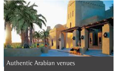
Authentic Arabian venues