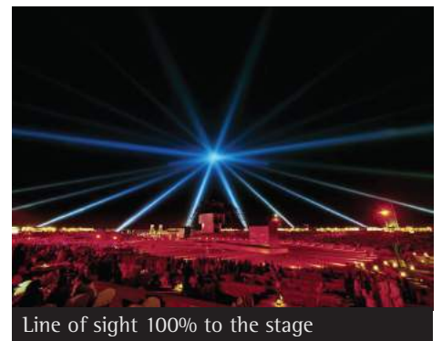
Line of sight 100% to the stage