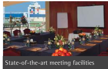
State-of-the-art meeting facilities