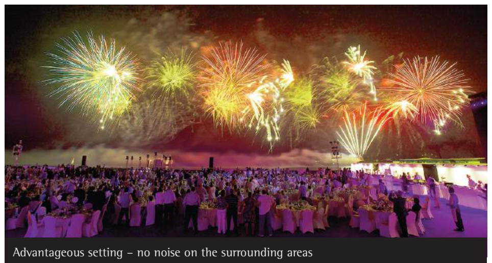
Advantageous setting – no noise on the surrounding areas