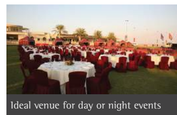
Ideal venue for day or night events