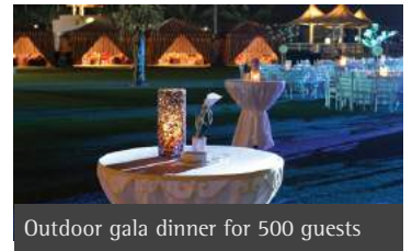
Outdoor gala dinner for 500 guests