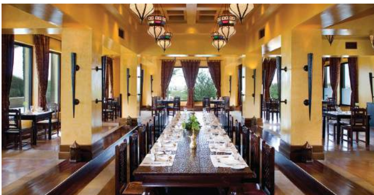
Al Forsan is a great venue for 500 guests