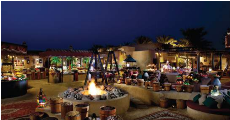
Al Hadheerah offers a magical evening for up to 1200 guests