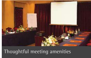
Thoughtful meeting amenities