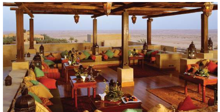
Rooftop venues with breath-taking views