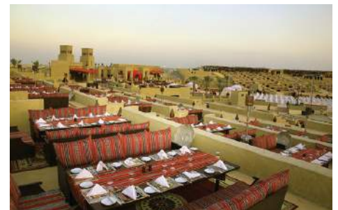
Up to 6,000 people seating for Gala Dinner