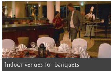
Indoor venues for banquets